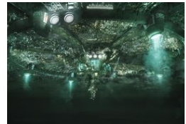
Web Ref RL7