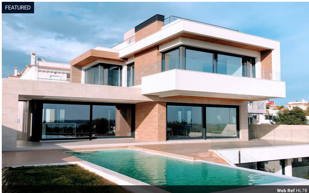
Web Ref HL78