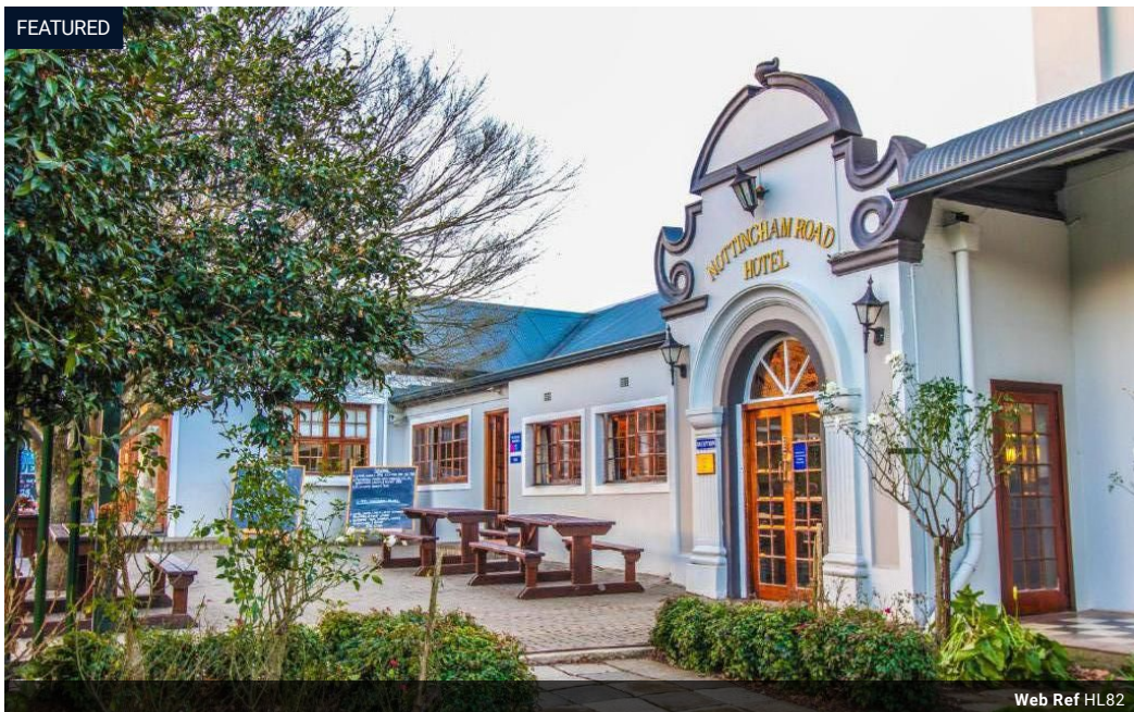
Web Ref HL82